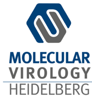
Dept. of Infectious Diseases Molecular Virology